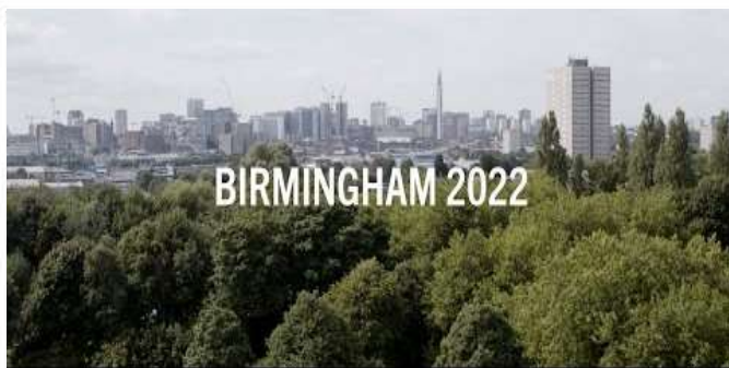
The countdown begins

The 2022 Commonwealth Games will take place in Birmingham. The event will run from the 28 th July to the 8 th August and see over 5000 athletes from 71 different teams, participate in more than 250 events across 19 different sports.