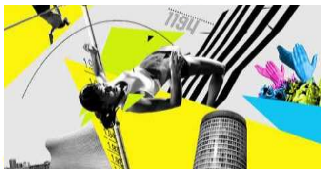
A celebration of greatness